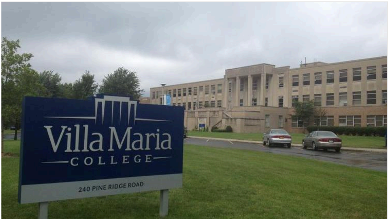
Villa Maria College's Cheektowaga campus.